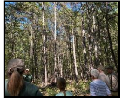
Field site demonstrating the need for timber management at the MO Tree Farm Conference.

Since starting in July, I've gotten the opportunity to meet many others in the area involved in natural resources, including private landowners, Missouri Department of Conservation employees, and Natural Resources Conservation Service employees, people involved in the timber industry, and other Extension professionals. I'm looking forward to developing these partnerships more in 2024 and collaborating on programs to deliver in southeast Missouri. Please contact me to talk more about what kinds of natural resource programming you'd like to see in your county. Looking forward to working more with you all in 2024!