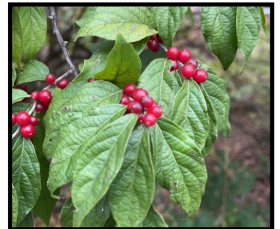
Invasive bush honeysuckle from an invasive species workshop in Versailles, MO. Other invasive species discussed included autumn olive, multiflora rose, wintercreeper, sericea lespedeza, princess tree, and eastern redcedar (a native field invader).