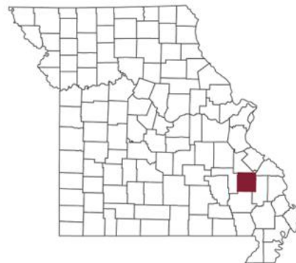
County population: 12,597