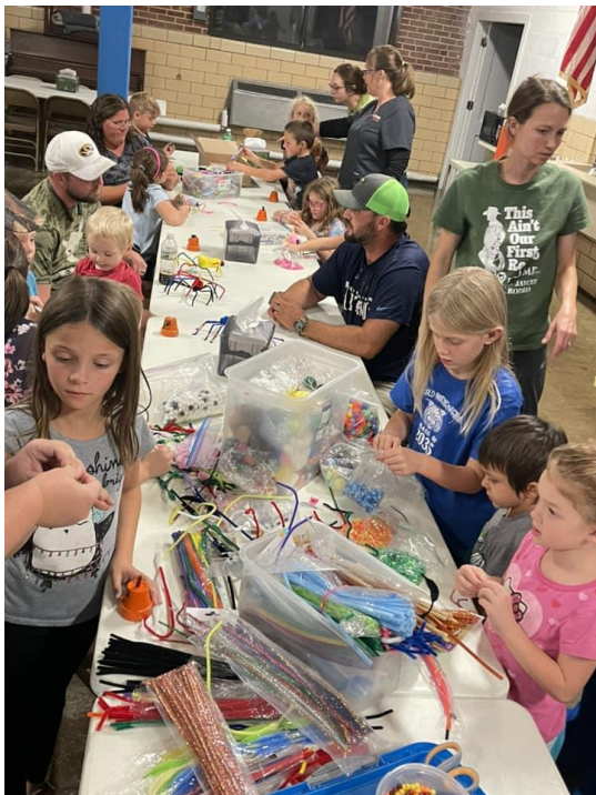
Leopold 4-H Club participating in Clover Kids Craft night.