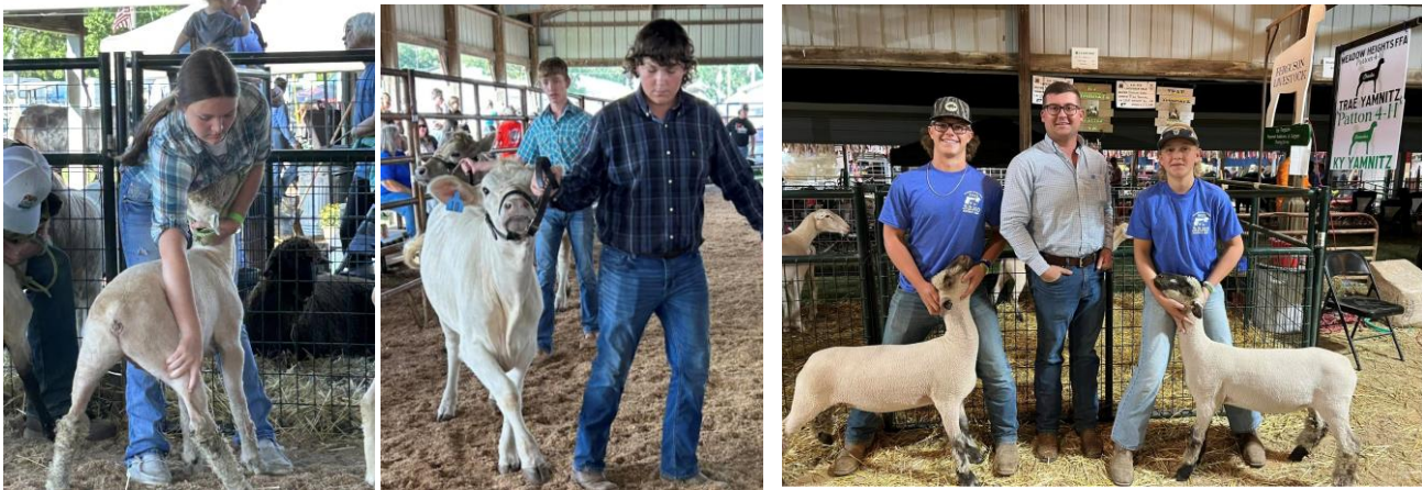
Country Club 4-H, (left and middle) and Patton 4-H (right) showing livestock at the SEMO District Fair.