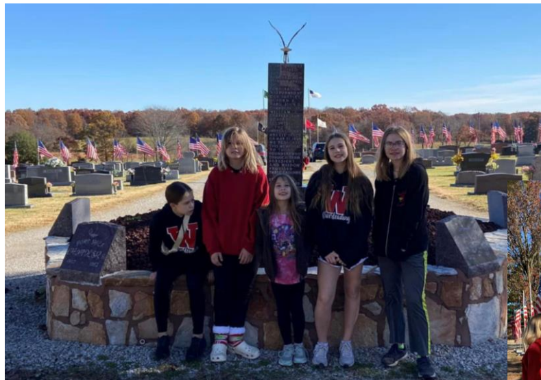
Crooked Creek 4-H Club volunteering to help display flags for Veteran's Day at Bollinger County Memorial Park.