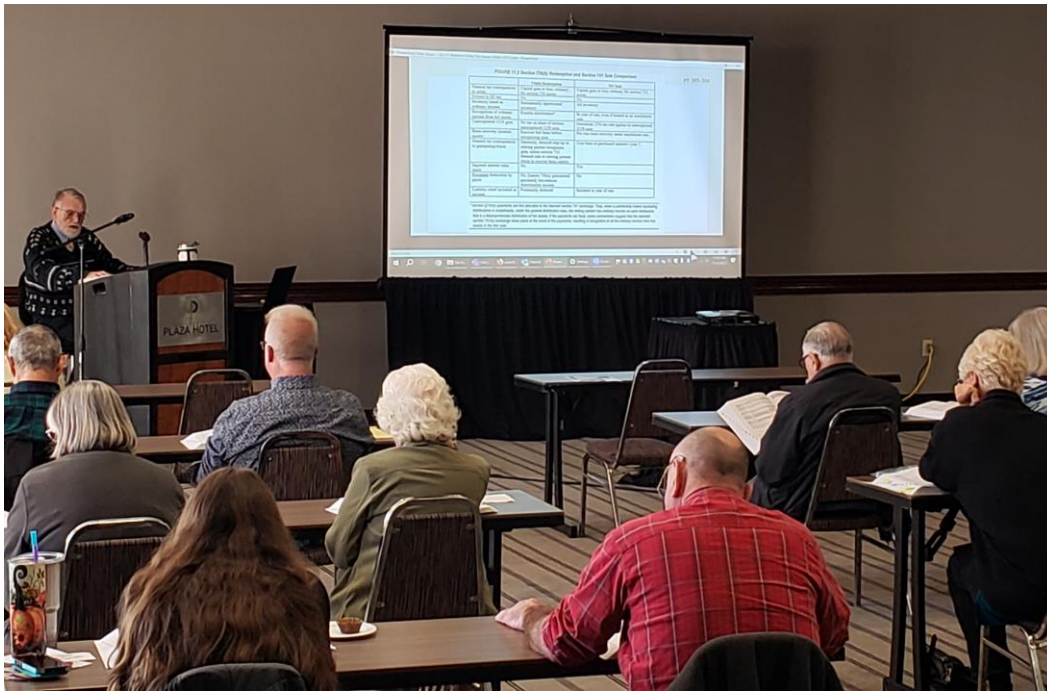
Left: Participants at Extension Tax School

Bollinger County had one attendee for 2023