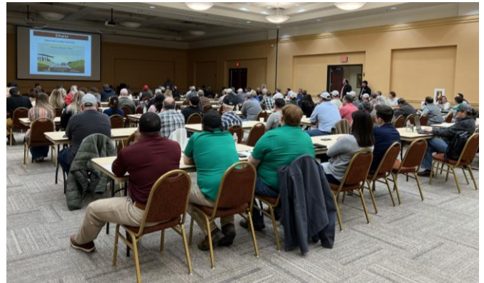
MU Crop Conference Meeting.

Overall, the research-based education increased overall knowledge in the topic areas which will lead to informed decisions that can help implement changes in management practices. Therefore, improving the economic viability of farm operations.