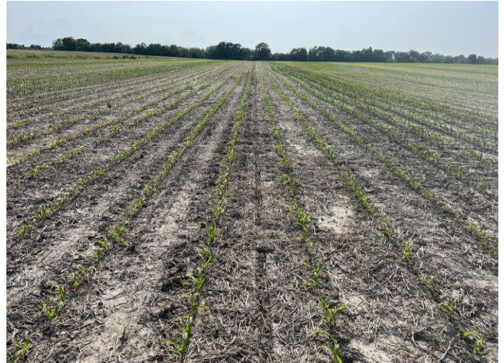
Corn field visit.

A total of 255 agronomic soil tests were reviewed and 140 producers were contacted through one-on-one education in Bollinger County.