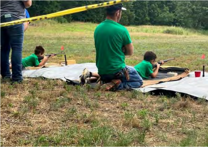
St. Clair County 4-H members participated in the State Shooting Sports competition in Columbia.