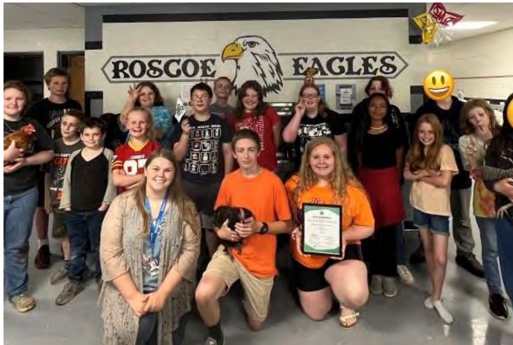
Roscoe Eagles Poultry Spin Club was a huge success.