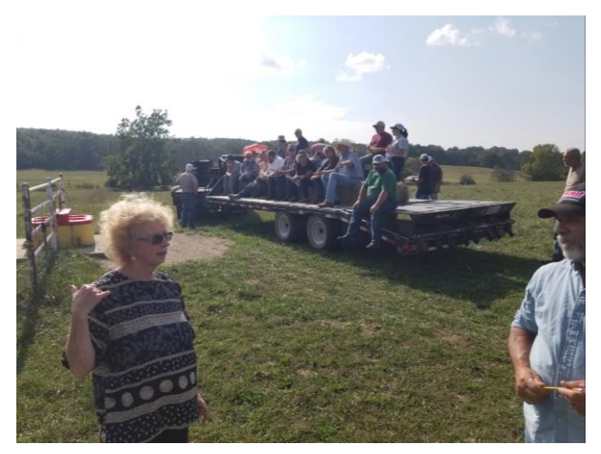
A Livestock producer shares her experience in developing and managing her grazing system at a Grazing School in Texas County