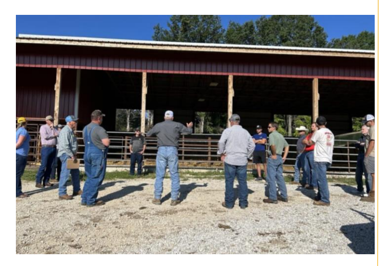
Producers learned how to add value to their cattle by finishing animals and marketing beef direct to consumers. They also toured a confinement beef feeding operation and learned from local processors.