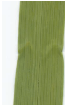
Figure 2. M-shaped watermark on a smooth bromegrass leaf.