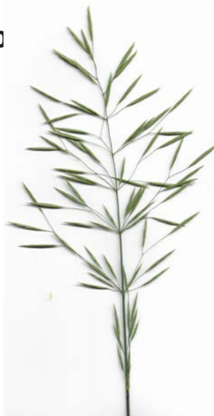
Figure 1. Smooth bromegrass seedhead just after anthesis.

Smooth bromegrass typically grows between 15 and 36 inches tall and flowers in late spring to early summer with an open panicle (Figure 1). One of its most identifiable features is the M-shaped watermark located midway between the leaf collar and tip (Figures 2 and 3). It spreads both by seeds and rhizomes, establishing itself quickly and becoming highly competitive once a stand is formed (Figure 4).