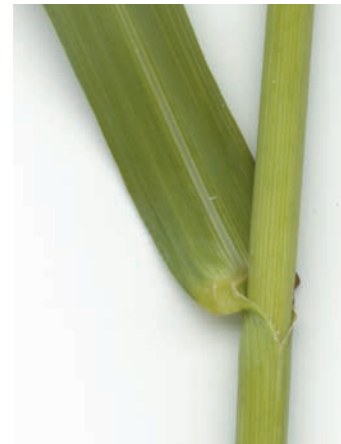
Figure 3. Leaf collar of smooth bromegrass. Note the open, V-shaped collar and membranous ligule.