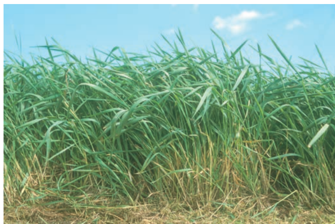
Figure 4. A vigorous stand of smooth bromegrass spreads by rhizomes.