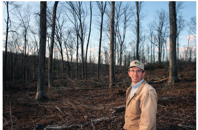
Figure 1. Becoming familiar with timber marketing and harvesting operations will assure you that the operations are proceeding according to your expectations.

There are two basic types of professional foresters: public and private. Public foresters work for either a state or federal agency. They can answer questions about managing your woodland and help develop your forest management plan. But landowners often have to wait for their assistance, and the type of assistance they can provide may be limited.