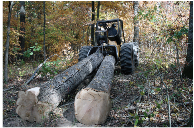
Figure 3. Visit the harvest area frequently to ensure the terms of the contract are being fulfilled and to increase your knowledge of harvest operations.

You should request that you and/or your forester be present the day harvesting begins. By being there, you and/or your forester will have the opportunity to discuss the operation with the buyer or the buyer's representative on